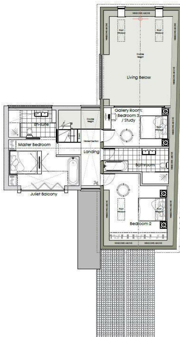
FIRST FLOOR Plan Scale 1:50